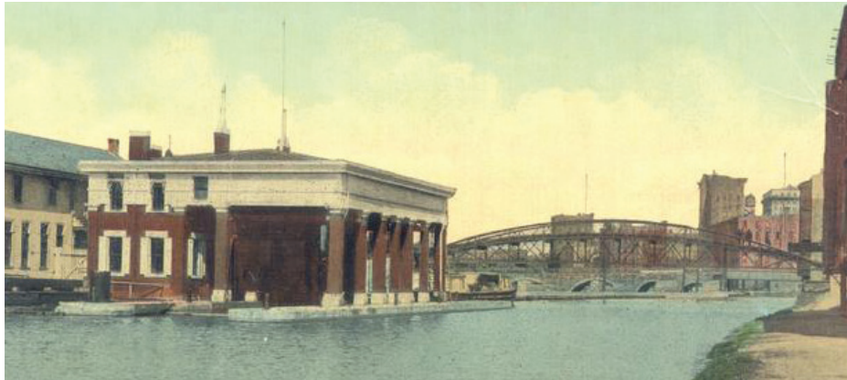
Weighlocks on Erie Canal, Rochester, N. Y.